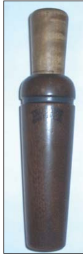
Lot 12 (left): Trutone Duck Call – Oak Park, Illinois. Blue Ribbon burlled walnut barrel call.