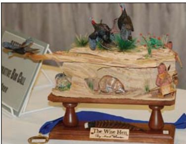
The Wise Hen