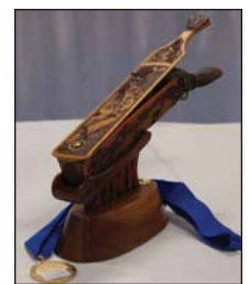
The Burned Box