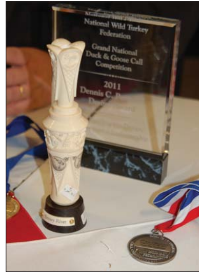
Best of Show