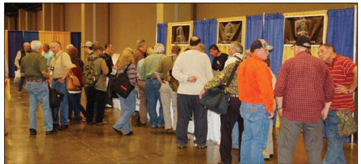
Collectors arriving for the appraisals.